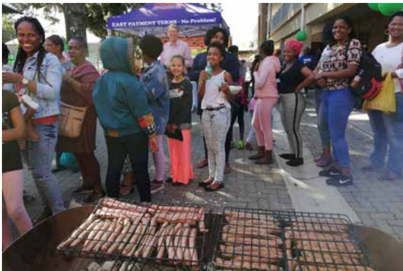
The Mini Bazaar Wors stall