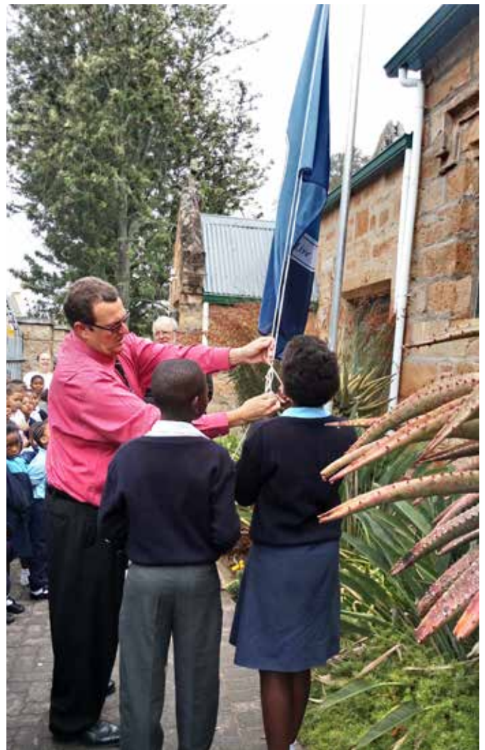
Flag-raising with Rotary representative after Rotary donated the Good Shepherd Flag to the School