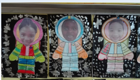
Grade 1 Astronauts

This term the Grade ones have been very busy learning about space. They have learnt the names of the planets in our solar system and the position of earth. This started with various writing activities, videos and stories, after which, the children got to make their own solar systems. In addition, we visited the Albany museum where we saw their solar system display and learned more about how the moon goes around the earth and what causes an eclipse. The Grade ones have had great fun decorating their class to look like space and imagining what it would be like to go into space as an astronaut.