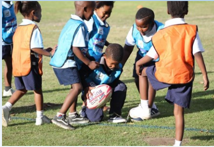
Foundation Phase pupils participating in the Rugby Ready Day