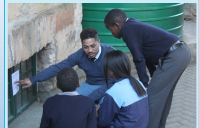
Pupils competing in a Maths Treasure hunt around school

Every week the pupils split into teams with members from each grade represented, to solve questions presented in fun activities. With points available to the best groups each week and prizes for the best performing pupils at the end of term, Maths club has cultivated a competitive attitude within the participants, pushing each other to develop their skills.