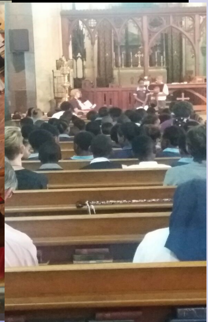
Ash Wednesday service